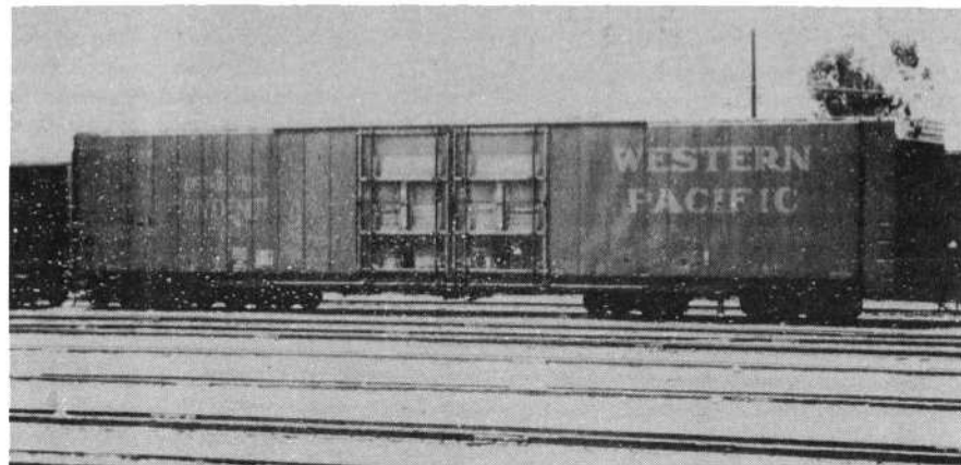
THE WP HIGH CUBE PICTURED ABOVE IS PAINTED BOX CAR RED , WITH SILVER DOORS .

THANKS GUYS!